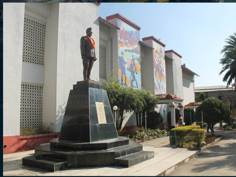
INDIAN NATIONAL ARMY MUSEUM