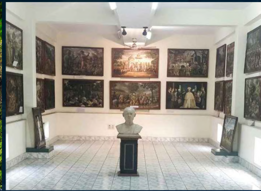
RKCS ART GALLERY