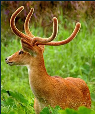
KEIBUL LAMJAO NATIONAL PARK